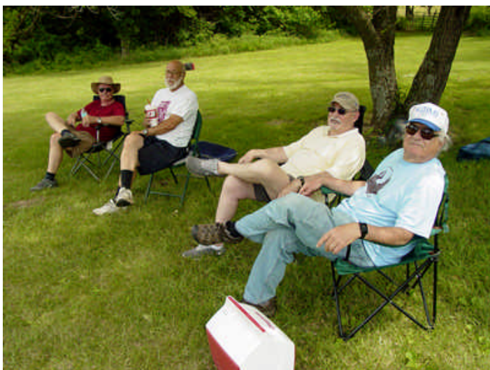
2. Doug's Supervisors: AD0AB, W0DEW, W0STD, K0IMI