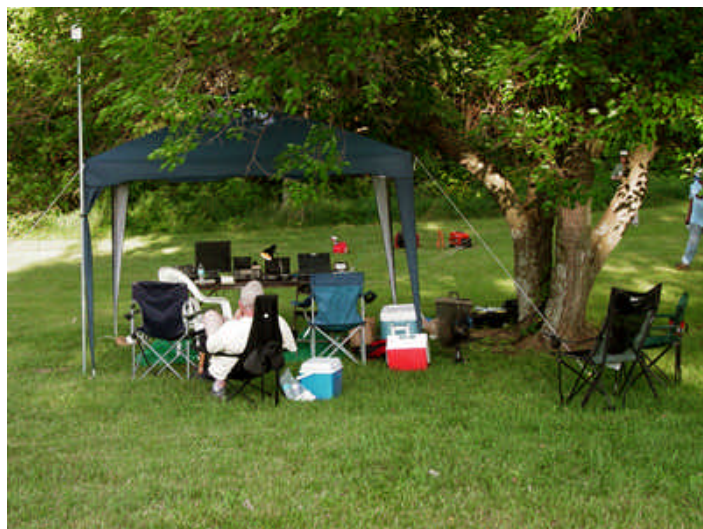
4. CW Station Essentially Ready