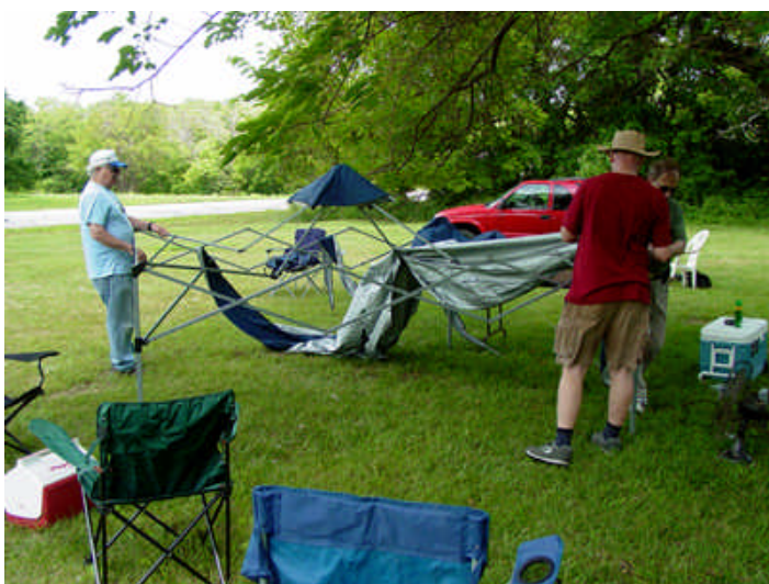
3. Time For The Station Shelter