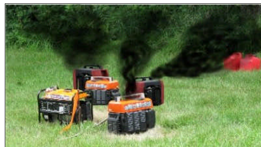
Zen and the art of generator maintenance - NØGSG