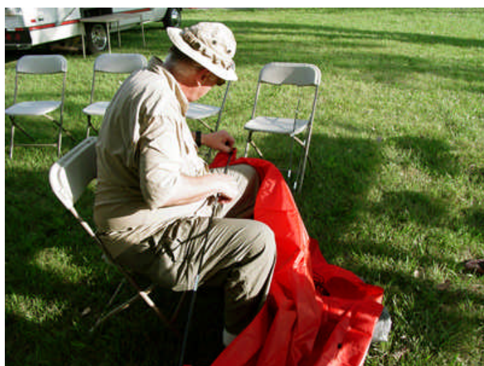
6. KA2FNK Getting The Overnight Shelter Ready